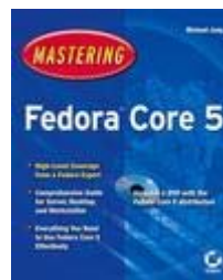
Mastering Fedora Core 5